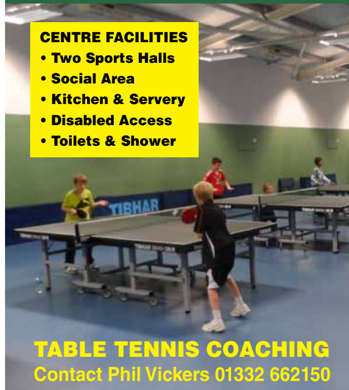
TABLE TENNIS COACHING