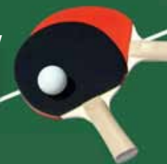
TABLE TENNIS CENTRE

Table Tennis England 5* Premier Club. Registered Charity No.1099237