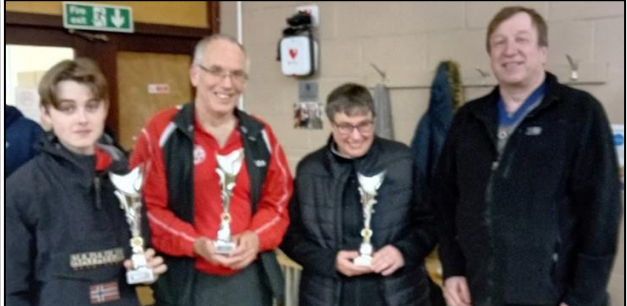
Watts Cup Champions Bexhillians B