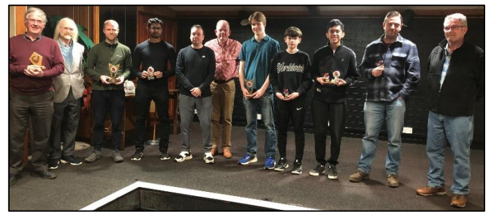
Some of Tackleway's players at the club presentation evening

Tackleway Jingkun were the team who benefitted little from the reorganisation of the playing personnel as they lost their strongest player from the previous season and were unable to replace him. Despite this, they approached each match with vigour and optimism and deserved to savour their solitary victory against Tackleway Karlsson.