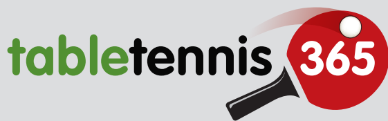
Table Tennis 365 Events Ltd