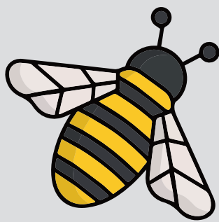
Table Tennis 365 Events Ltd