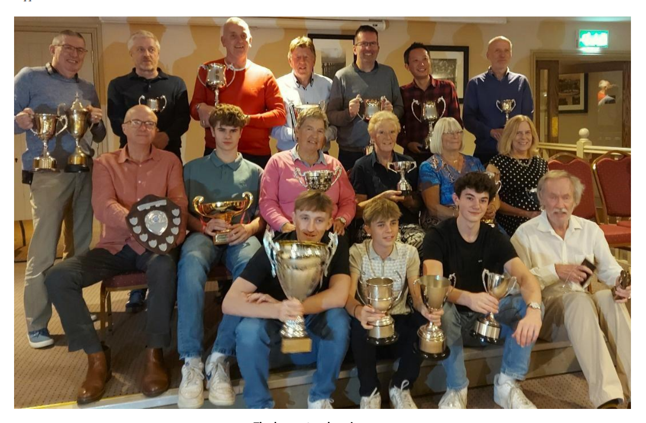
The happy trophy winners