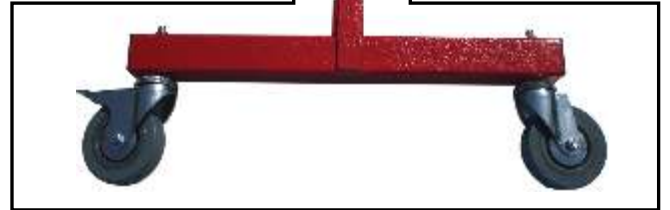
P-9 - 560x165x38x38 MM - QTY. - 4