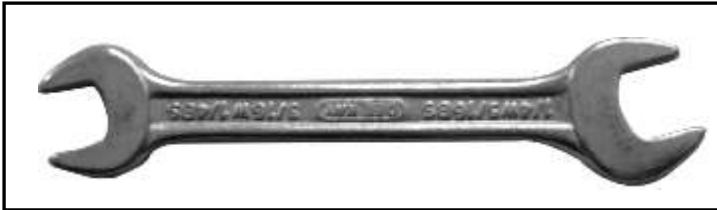
P-32 - 7.5/6 MM - QTY. - 2