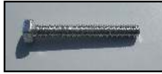
P-28 - 62x7.5MM - QTY. - 8