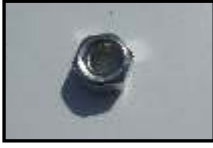
P-28 - 7.5MM - QTY. - 8