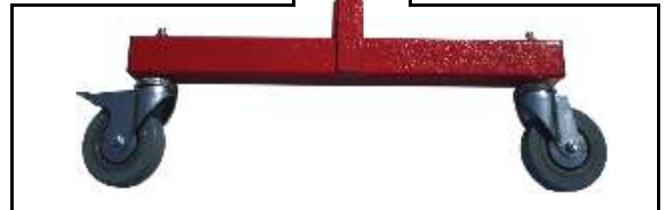
P-9 - 510x200x45x45 MM - QTY. - 4