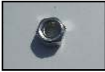
P-28 - 7.5MM - QTY. - 8