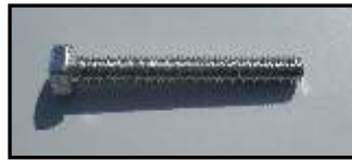
P-28 - 62x7.5MM - QTY. - 8