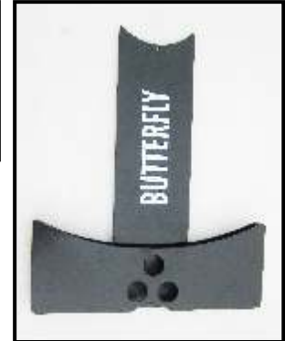
P19 - Qty. - 2 NOS.