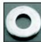
P22 - 9MM Qty. - 8 NOS.