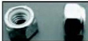
P22 - 8MM - Qty. - 8 NOS.