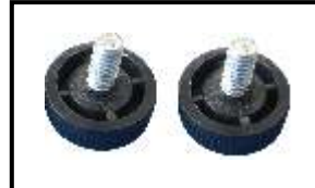
P31 - 19X6MM Qty. - 4 NOS.